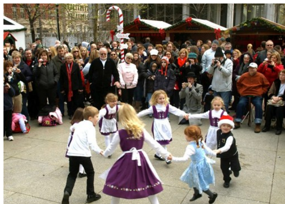
Kinder Group Dancing at Christmas Village in Philadelphia