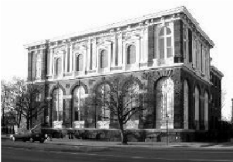
The German Society of Pennsylvania hosted many other events during the celebration week.