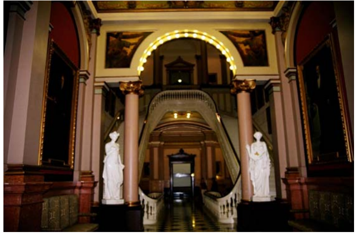
The Masonic Library and Museum offered a Temple Tour and Presentation on the role of German-Speaking Lodges on October 4.