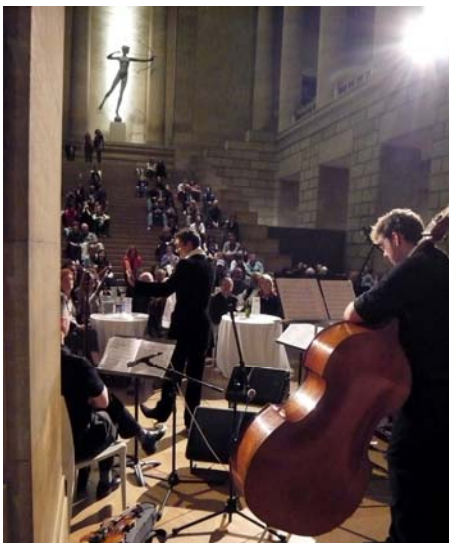
The Philadelphia Museum of Art and the German-American Day Celebration Committee sponsored the October 3 Art After Five program featuring the German cabaret scene of the early 1920s in the Museum's Great Stair Hall.