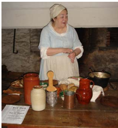
Historic RittenhouseTown provided demonstrations on colonial German cooking and papermaking on October 4.