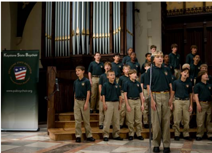
The Keystone State Boychoir performed a special German-American Day Concert on September 28.